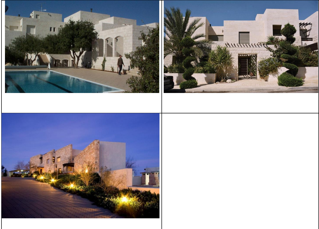
Figure 14 projects exemplifying the architecture of Amman