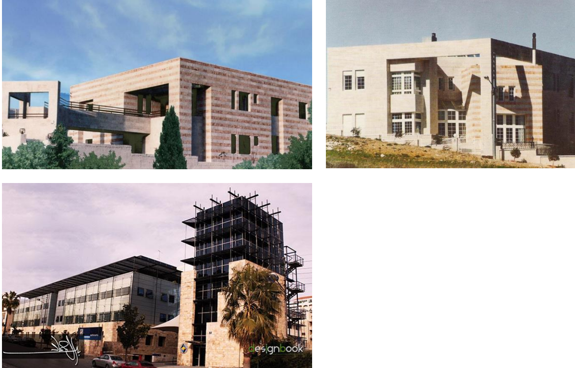
Figure 13 the merging of the modern and the regional

It should be noted that the vocabulary of this style of architecture is derived from a regional repertoire rather than the limited local vernacular vocabulary or the wide traditional one, which people usually refer to as the Islamic architecture. This trend which is based on the modern principles and holds the local tradition through the images it uses, managed to produce an architecture that is aesthetically pleasing and theoretically acceptable but still have to be developed more so as to become a methodology with principles rather than a trend carried by some architects.