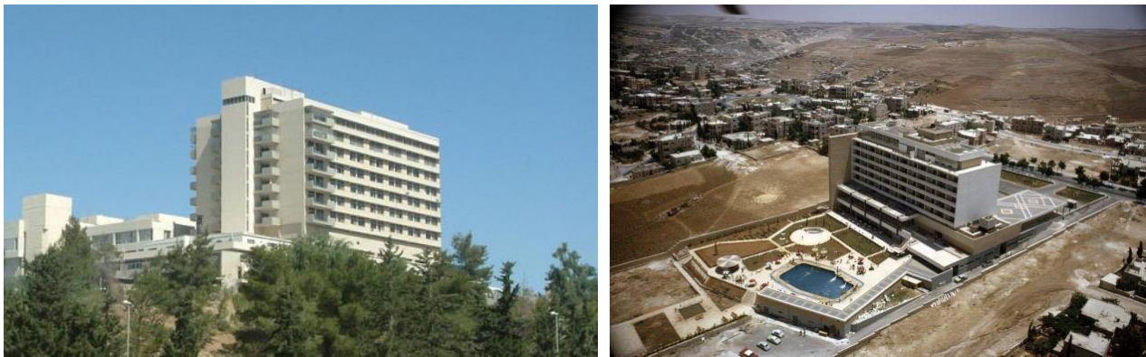
Figure 3 University of Jordan Hospital (left) and the Intercontinental Amman (right)

The period of the 1960s up until the middle 1970s' witnessed a domestic modern architecture that had both character and style; the modernist influence merged with local building tradition of masonry and stone to produce what can be labelled "domesticated modernity" (Daher, 2008 a) (fig 4). The period of the 1970s' up till mid 1980s' witnessed an economic boom due to rising oil prices, which influenced most sectors of society including the construction industry. Countries of the Middle East including Jordan initiated a new phase of development and construction led by both international and local architects. In Amman, two architectural trends dominated; an eclectic extravaganza of designs that exhibits wealth and financial power (fig 5), and a kind of picturesque Islamic revivalism that expressed nostalgia to the past (fig 6). These trends reflected a state of confusion in a culture that is both dogmatic and undefinable i.e. neither traditional in the authentic sense, nor contemporary in the modern sense, a mutated hybrid. By the mid of 1980s' a new generation of practitioners came into the scene; architects who were interested in rediscovering and reinterpreting local Jordanian cultural values and expressing them architecturally. A sort of regional architecture was born and was gaining momentum among practitioners and university educators. Interest in the vernacular emerged and several public and touristic projects followed that trend.