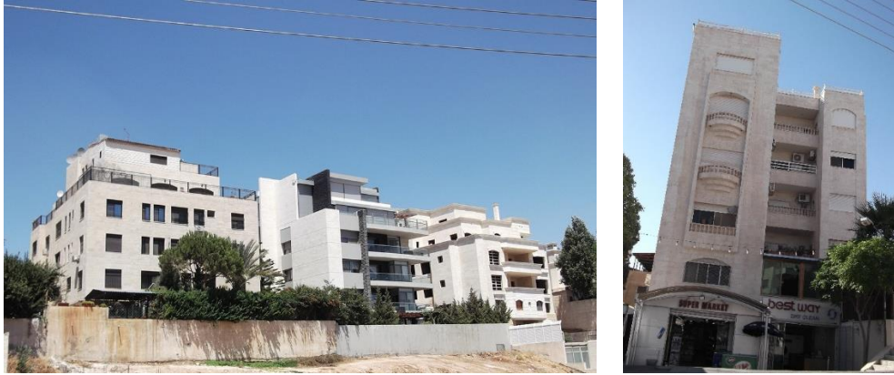
Figure 7 residential buildings

The effect on the local architecture was immense; on one hand, Amman was forced into new urban developments of a contemporary image to compete in a world market and attract capital (fig 8). Its architecture was one of manufactured “sameness” with a universal mode of expression could be found anywhere and of an everywhere; thus buildings are reduced into a sort of tourist post card attractions or “free floating signs”(AlAsad, 2008). On the other hand, a new “universal” architecture that expressed formal manipulation and an understanding of what contemporary theory of architecture started to emerge with practicing young architects (fig 9).