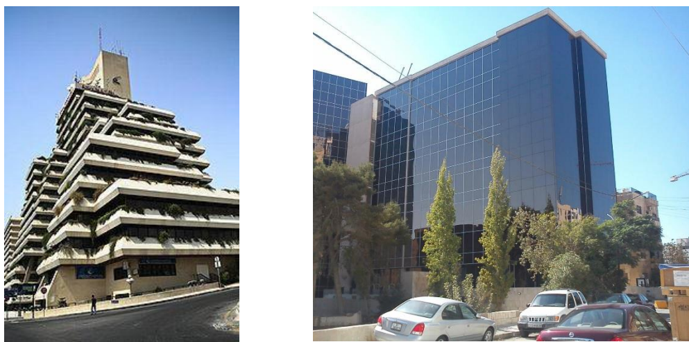
Figure 10 samples of modern architecture

Buildings conforming to this group are characterized by: the simplicity and clarity of forms with the elimination of detailing and decoration, orthogonal designs with a visual emphasis on horizontal and vertical lines, materials honesty in expression and structure, the visual expression of structure, the extensive use of industrially-produced materials and the adaptation of machine aesthetic, and the illusion to the International Style of modernism (fig 10).