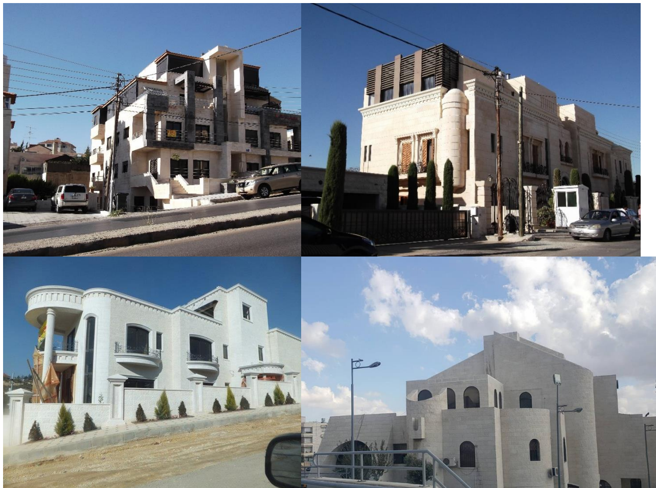
Figure 11 eclectic architecture of Amman

This trend was most dominant on the period of the late seventies and the early eighties due to the increased wealth and the need to express this wealth by being different by the means of using different forms, expensive materials and following different styles. Nevertheless, some architects who work in this trend practice a kind of organized eclecticism, where they are aware of what they are doing and they do it according the codes of aesthetics and implying a certain rationality in their design solutions. It should be noted that this kind of architecture results from the freedom in the architectural expression and from the state of confusion of the society (fig 11).