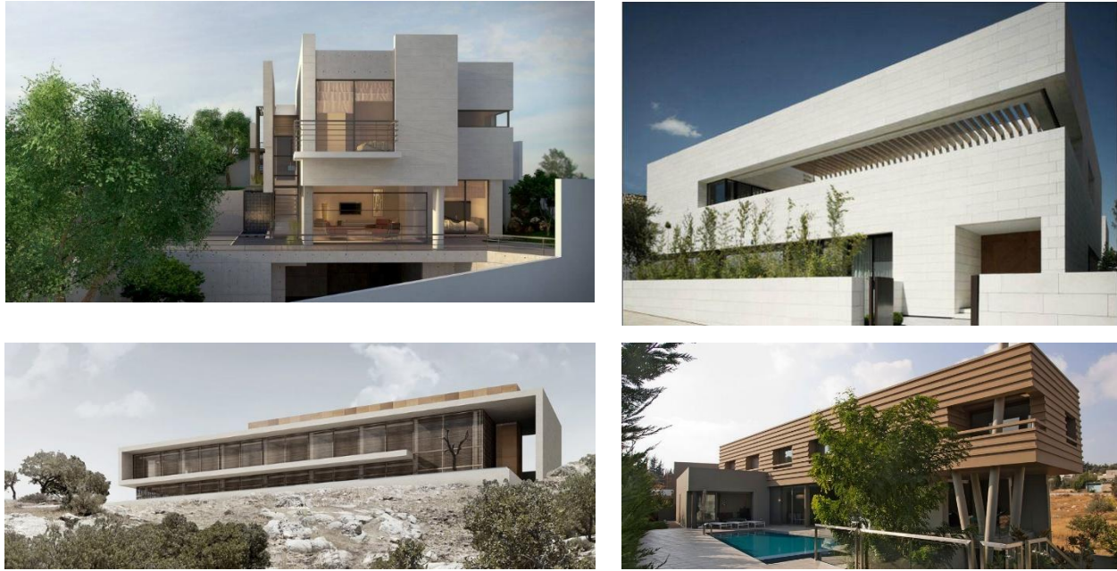
Figure 16 samples of the contemporary architecture of Jordan