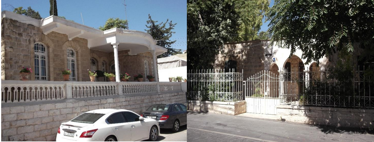
Figure 2 old houses of Amman