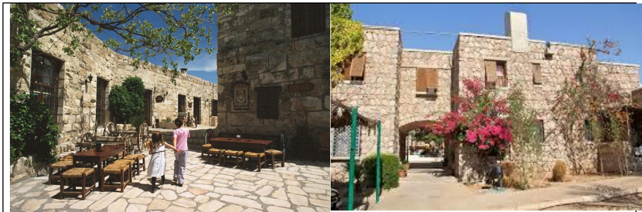
Figure 12 Kan Zaman Restaurant (left), and the SOS Village (right)

In contrast to what is known as polite architecture, vernacular architecture relies on the design skills of local builders, not professionally trained, to respond to local needs and conditions, using locally cultivated building material, and reflecting local traditions. It is a trial to revive the image of the village architecture found in the rural areas of Jordan with the use of the vernacular elements and treatments such as the use of local building like rough stones and mud, spontaneous massing and the manipulation of the opened and closed spaces. Most attempts in neo-vernacular architecture falls under what Ozkan (2007) Labelled interpretive vernacularism an approach to bringing a new life to vernacular heritage for new and contemporary functions. The widest area of the application of this approach is obviously the architecture for tourism and culture (fig 12). In that sense, this trial did not exceed the renovating of some of the existing buildings for private use or the renovating some villages with the use of modern technology and hiding it behind a layer of vernacular treatments to give the required image for commercial purposes. It could be said that this trend did not exceed the theme of fashion for the recreational purposes for the use of the rich due to the large expenses it needs and to the loss of the traditional craftsmen who were able to produce this type of architecture.