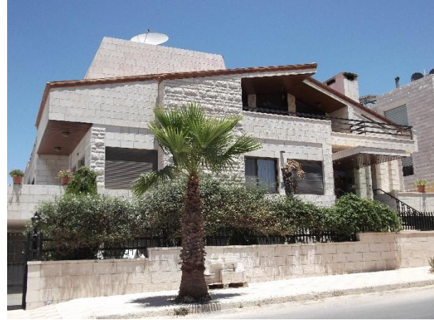
Figure 5 eclectic architecture of the seventies