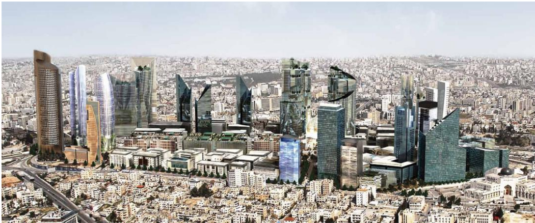
Figure 8 the Abdali development in Amman as an example of urban globalization

The effect on the local architecture was immense; on one hand, Amman was forced into new urban developments of a contemporary image to compete in a world market and attract capital (fig 8). Its architecture was one of manufactured “sameness” with a universal mode of expression could be found anywhere and of an everywhere; thus buildings are reduced into a sort of tourist post card attractions or “free floating signs”(AlAsad, 2008). On the other hand, a new “universal” architecture that expressed formal manipulation and an understanding of what contemporary theory of architecture started to emerge with practicing young architects (fig 9).