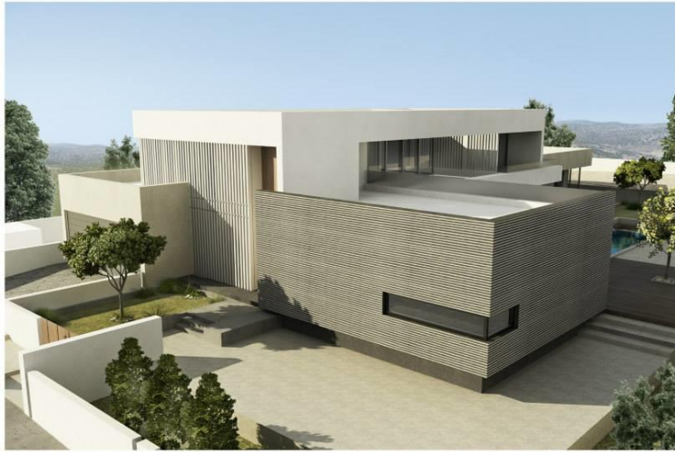
Figure 9 private residence by Morph x Design Studio

As can be seen from the review above, Jordan, in the last forty years, went through dramatic changes in its socio-economic conditions resulting in various shifts in its cultural environment. Accordingly, its architecture changed in response to the new cultural landscape; looking around Amman, a mixture of buildings ranging from small scale houses to high rise buildings of various functions and large housing projects following different architectural styles and schools of thought and varying between modern styles and traditional one, from aesthetically pleasing to visually displeasing and from culturally acceptable to totally alien can be found. More recently, rapid urbanization, technological advances, and wide spread use of digital media, resulted in more diversification of Jordan's architectural built environment, depriving its architecture of its cultural and regional identity, and leading to a break in the continuity between its inherited morphology and the more recent architectural developments (Rababe'h, 2010). Such a condition, warrants close examination and preliminary classification of such stylistic trends.