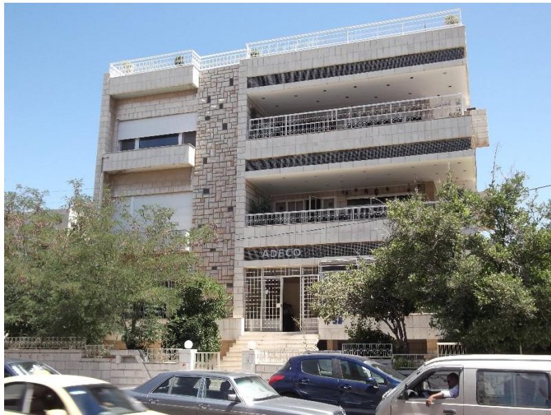
Figure 4 modern architecture of the sixties and early seventies