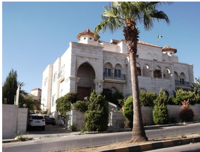
Figure 6 Islamic picturesque

Rapid social and cultural change marked the end of the 1990s' till mid 2000s' due to globalization and rapid geo-political transformations. Globalization was supported by the rise of international neoliberal values and facilitated by the wide spread of digital media. Digital media, the free mobility of capital and goods facilitated the spread of a culture of consumption and advocated an optimum universal character of contemporary living (Ricoeur, 2007). This contemporary image stretched on all scales of human artifacts and commodities from small-scale products up to entire urban developments. The rapid geo-political transformations due to both the Gulf conflict and the September 11 events affected Jordan directly; a new wave of immigrants from the Gulf, mainly Jordanian returnees and Iraqi refugees concentrated in Amman, brought their lifestyle, as well as capital (Jarrar, 2013). This influx of newcomers demanded large scale housing, which caused boost in residential building (fig 7) and the construction of high end residential villas.