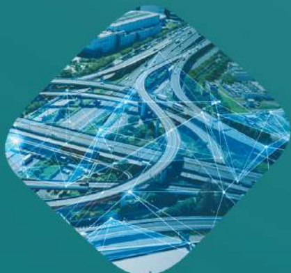
Transportation Engineering and Urban Planning