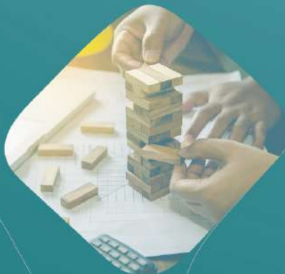
Construction And Risk Management