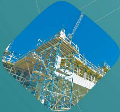
Structural And Earthquake Engineering

Papers are invited in main civil engineering tracks including the following areas: