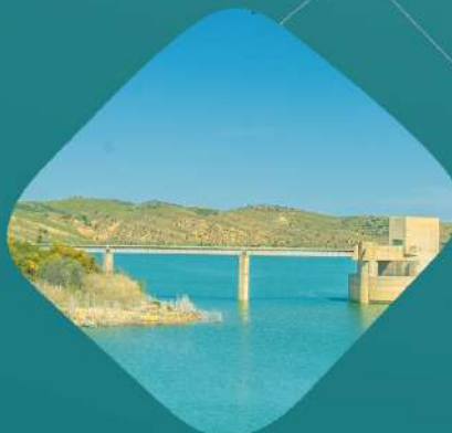
Water Resources Management and Environmental Engineering